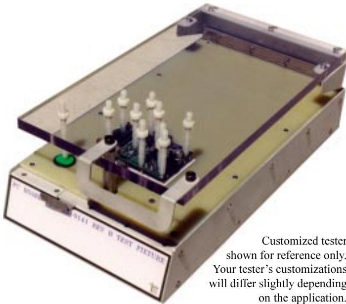
Customized tester shown for reference only. Your tester's customizations will differ slightly depending on the application.

Now combine the TE-1100 test fixture with National Instruments data acquisition boards and perform functional, in-circuit, or bare board testing right on your bench top!